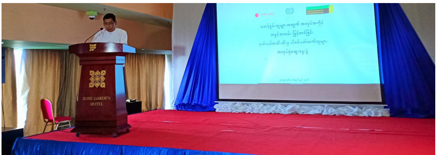
U Myo Aung, Permanent Secretary, Ministry of Labor, Immigration and Population

In his opening speech, Permanent Secretary of the Ministry of Labour, Immigration and Population , U Myo Aung outlined government activities since the first Forum, including the adoption in December 2017 of the Rules to implement the 2015 Law Protecting the Rights of People with Disabilities. He also mentioned that the Disability Rights Working Committee has been drafting a national strategic plan to implement the ASEAN Enabling Masterplan 2025 to support the rights of persons with disabilities in the ASEAN region adopted at the ASEAN Summit held in Singapore on 15 November 2018. The Master Plan encourages promotion of equitable and inclusive opportunity to employment and entrepreneurship and economic integration for Persons with Disabilities.